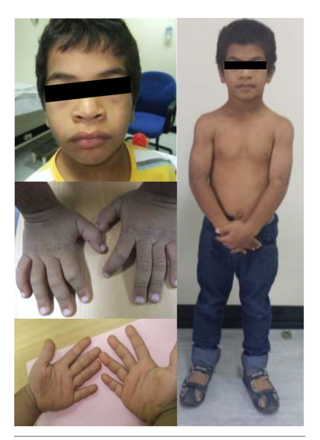
Figure 2: The patient aged 10. Note the characteristic facial features such as macrocephaly, coarse and flat face, periorbital fullness, hypertelorism, flat broad nasal bridge, upturned nose, anteverted nares, thick prominent lips, generalized muscular hypertrophy, and puffy, short, broad hands with rough and doughy texture skin.

The child was thoroughly investigated, and his initial workup showed a microcytic, hypochromic